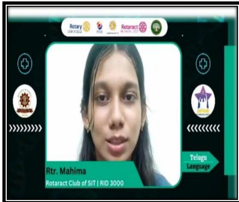
Fig 1.3 snapshot taken while delivering the speech