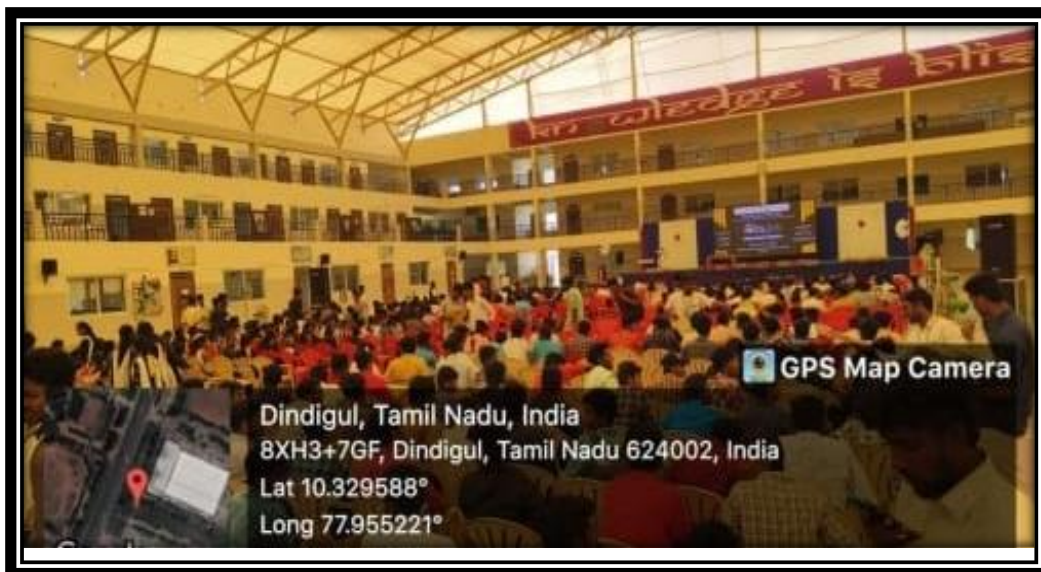
Fig 1.12 Taken while speaker session

The XXXIII DISTRICT ASSEMBLY organized by the Rotaract club of Dindigul and Rotaract club of Parvathy's College Of Arts and Science on 12th August 2023 at 8:30 AM. The venue of the event was at the Parvathy's Anugrahaa International School, Madurai Road in Dindigul. Our District Governor and DRR were very interactive and we were able to learn about the Rotary and Rotaract, RYLA, IDYE and other basics. The event was all about the Training sessions for grooming all the Executive Council Members starting from the President, Secretary, all the Directors and the members. There we had many events and fun activities. We had a great LUNCH time over there with our Rotaractors.