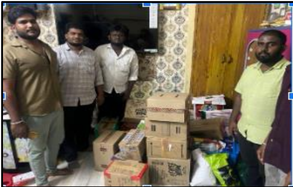
Fig 1.18 Snapshot taken during Wayanad Relief.

In response to the Wayanad landslide disaster, our club organized a fundraising initiative, where volunteers visited various departments to inform students about the effort. Over two days, on August 5 students donated approximately ₹15,000 in cash and around ₹10,000 worth of relief products. The cash donations were used to purchase additional relief supplies, which, along with the donated products, were handed over to the Helping Home organization the following day. A week later, Helping Home successfully delivered the relief items to the affected communities in Wayanad. This initiative demonstrated our college& solidarity and commitment to helping those in need during a time of crisis.