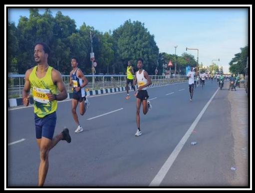
Fig 1.17.2 while running

Number of the participants attended the event