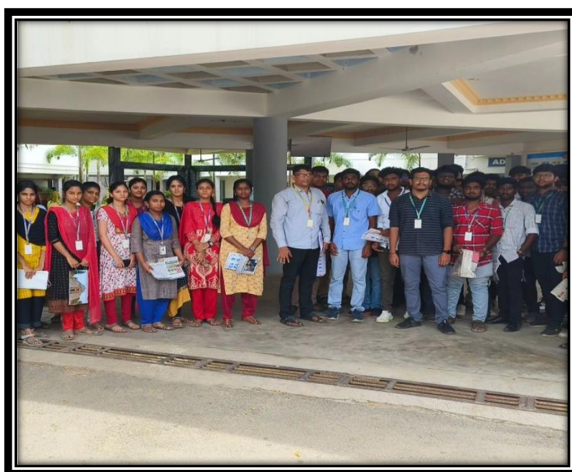
Fig 1.5 taken while creating awareness about plastic bags

We collaborated with The Rotaract Club of DYPUSM and took part in the event KAGZERIA which is an initiative taken to promote the use of paper bags and stop polluting the environment with plastic bags. On 12th of July, our members made paper bags on their own and distributed them to the nearby shops and pharmacies. It was really a very good experience in interacting with common people and creating awareness to them. We got many feedbacks from shop owners and they were very much interested in selling their products in paper bags. In medical shops, the tablets are being sold in paper covers but the other products aren't. Some of them even requested us to provide paper bags to them frequently so that they could avoid plastic bags completely.