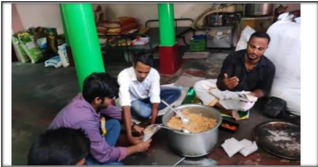
Fig 1.7 while packing foods

The “Oru Velai Soru” is a service provided by the Rotaractors to the people who are in need of food. Food packets are distributed by our volunteer team every week. Breakfast and Lunch will be provided to the people who reside in railway station and in other public places. We got our time slot to be done on September 3 rd of 2023. This is really a satisfactory and blessed opportunity to serve the needy people at the right time. This is to be considered as a signature event of our ROTARACT CLUB OF SIT.