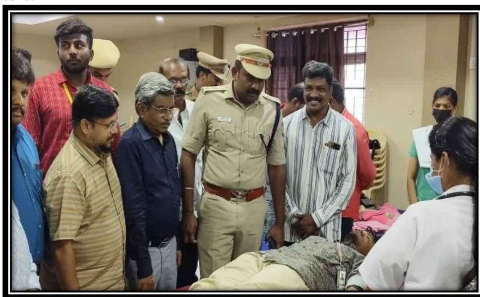
Fig 1.10 while donating blood

Our Rotaract Club of Sethu Institute of Technology in association with Nallor Kuzhu and Indian Red Cross Society had organized a BLOOD DONATION CAMP AND DRUG AWARENESS PLEDGE on 25th of September, 2023 at the Pavendhar Bharathidasan Auditorium by 10 AM in our college. The event began with the Drug Awareness Pledge taken by the Rotaractors and proceeded with the welcome speech of the Chief Guest. Our SP Sir gave a detailed presentation regarding the Drug Awareness and Individual's Responsibilities to our Rotaract Members. A great total of 100 students donated their blood in our camp. On the special occasion, we made the event successful with the help of the GH Medical team, Nallor Kuzhu, IRC members and our Rotaractors.