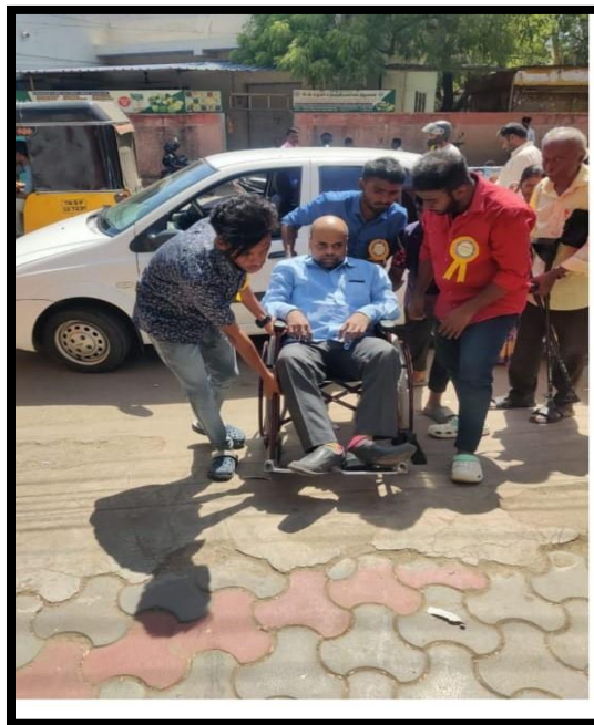
Fig 1.6 Picture Taken while helping peoples The list of students participated in the event.

The Rotary Club of Madurai East in association with the Tamil Nadu Physically Challenged Association has conducted the MEGA SWAYAMVAR for Physically Challenged Persons on August 6th, 2023. The event began around 12 PM and the venue was planned at the Sashti Mandapam, Poonga Murugan Temple in Madurai. We were really excited to be a part of this event servicing the physically challenged persons. Our team organized the event successfully and the organizers were very much satisfied on our work. Our President called out the token names and we helped them in wheel chairs. Our President received memento from the organizers.