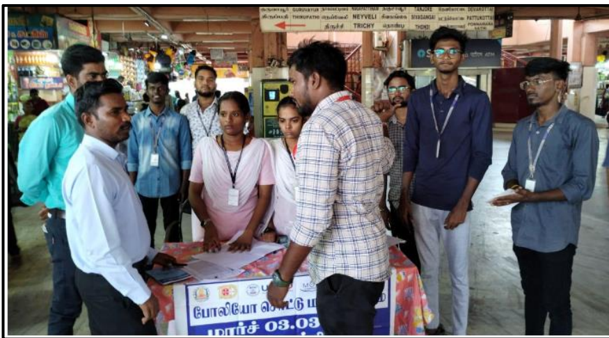
Fig 1.17 Snapshot taken during Polio Camp.

A team of students from our RAC SIT have been sent as volunteers for the children and their parents who have come for POLIO DROP. Our Student Rotaractors helped those people on 3 rd of March. Our Rotaractors felt very satisfied in helping those children and event organizers and spending a great time with them. This event, & quot;VOLUNTEERS ASSISTANCE FOR POLIO DROP EVENT & quot; has been undertaken by our Rotaract Club of Sethu Institute Of Technology with great dedication and professionalism.