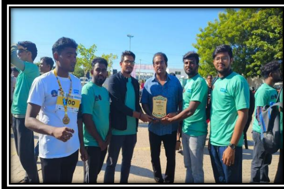
Fig 1.17.1 while receiving memento

We jointly host the Madurai mini marathon which held on 24 th September 2023 at decathlon. More than 1000 participants are participated in the marathon it was a awareness marathon which against drug and to make drug free society