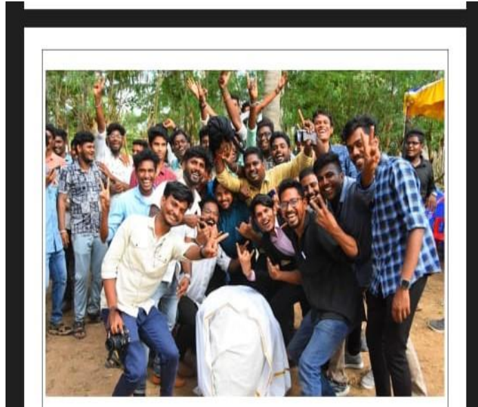
Fig 1.15 Tops and Dots Celebration

TOPS AND DOTS is an event conducted by the Rotaract Club of Arandhaangi & Vidiyal Rotaract Club of Arandhaangi in Selection Matriculation School, Arandhaangi on July 29th and 30th of 2023. It is a 2-day training session conducted for the President and Secretary regarding the development of our club.