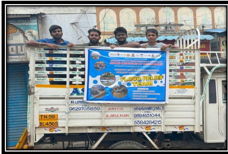
Fig 1.16 Flood relief Event

Rotaract Club Of SIT along with Rotaract Club Of Madurai Lemurian and Rotaract Club Of Madurai North has actively involved in the distribution of Flood Relief Products on 21st of December, 2023 in the Kaalvaai Village and other small villages in the Thoothukudi District. The Rotaract club of Thiagarajar Arts , Rotaract club of Sacs, Rotaract club of Perceptors and the District Team have lent their helping hands towards this contribution. We have contributed 250 kgs of Rice, 250 kgs of Dal Varieties, Milk Powder, Biscuit Packets, Blankets, Medicines, Sanitary Napkins, buckets and water pots, Food and Water to nearly 1000 people over there. We are grateful to The ARR Sudarshan who has helped us throughout the distribution. This has been successfully completed with the help of the donors and we thank them all for this contribution