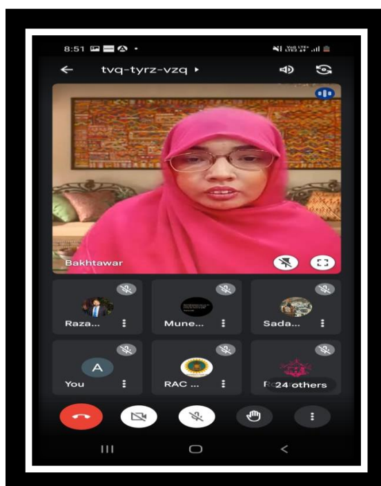
Fig 1.2 snapshot during the session