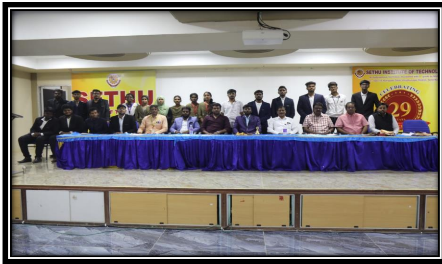
Fig 1.9 Picture Taken with Core Team

The 7 TH INSTALLATION CEREMONY AND ORIENTATION PROGRAM of our Rotaract Club of Sethu Institute of Technology [CLUB ID NO: 213044] was organized on 26th of September, 2023 at the Pavendhar Bharathidasan Auditorium by 10 AM in our college. Our RAC SIT lies under RI DISTRICT 3000 which is sponsored by our parent club the ROTARY CLUB OF MADURAI NORTH.