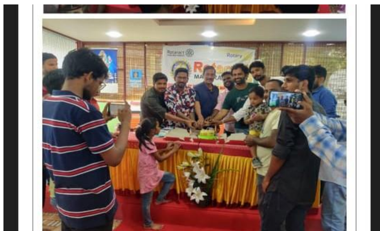
Fig 1.15 Taken while cake cutting

Potluck Lunch is a Fellowship Meet conducted by the Rotaract Club of Madurai North (RID 3000) on August 13th, 2023. The meet began around 10 AM and the venue was planned at the Alagar Boomi Farm at Alagarkovil, Madurai. It was a Signature Event which we attended for the first time. We had a very good time with all the Rotaractors. This meet was all about a get together with our Rotaract families. There we explored nearly 30 varieties of food items prepared by 30 Rotaract Families. We were thankful to be a part of this POTLUCK