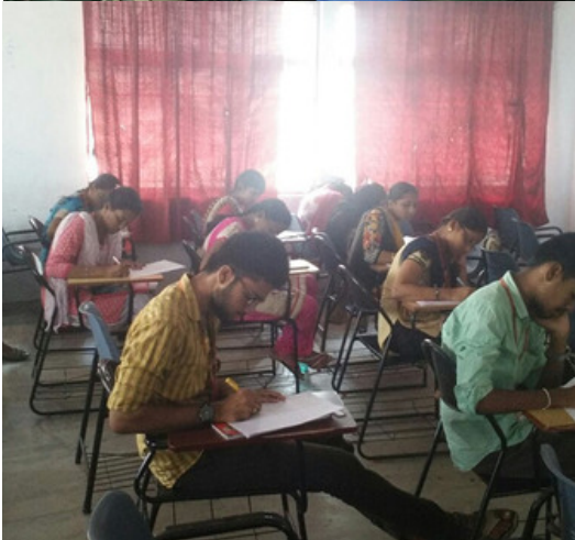
Teacher: Ms. Teacher