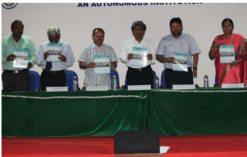
Release of CEASIT Newsletter on 25.03.2015