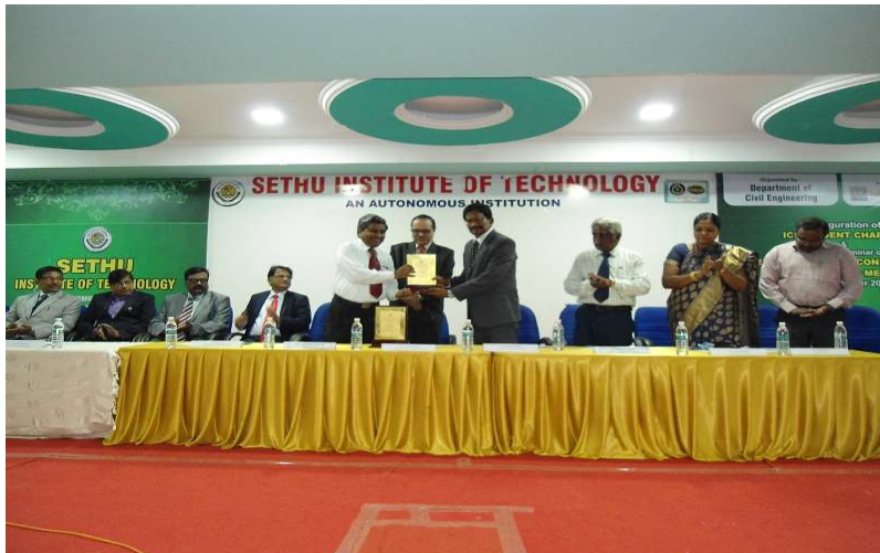
Inauguration of “ICI STUDENTS CHAPTER” on 10.09.2015