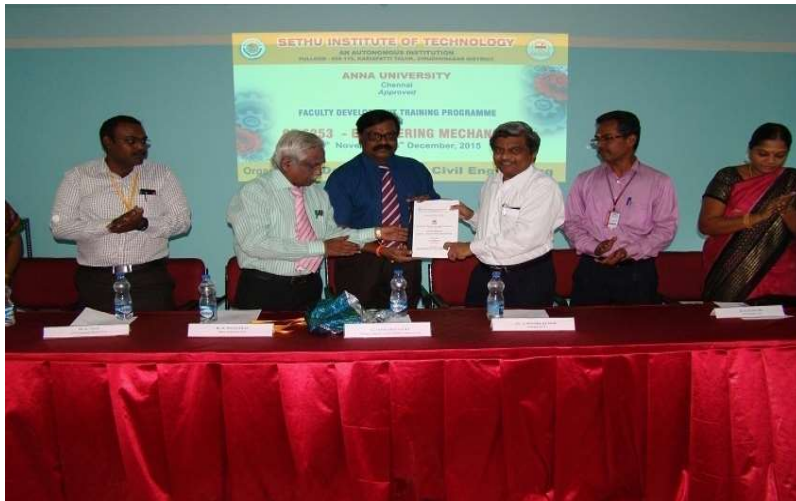
Anna University approved FDP on Engineering Mechanics from 30.11.2015 to 06.12.2015