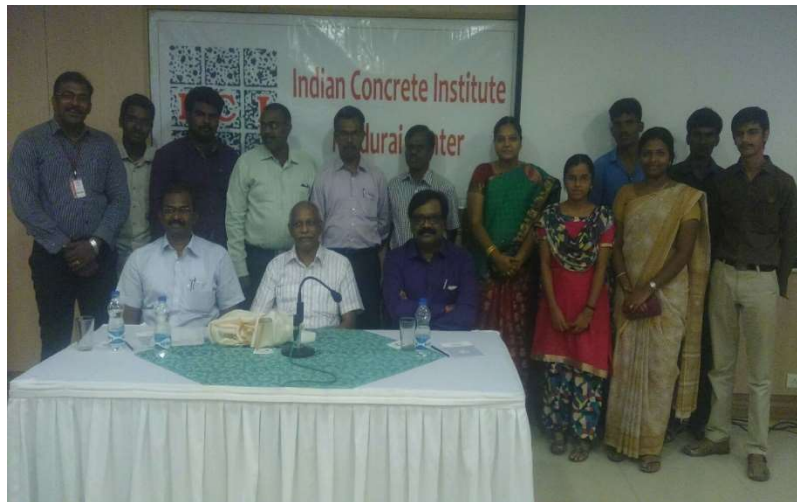
Intra Departmental Students Technical Symposium on 03.04.2017

Two weeks faculty development training program on “ Limit State Design of Steel Structure ” sponsored by AICTE from 07-11-2017 To 20-11-2017