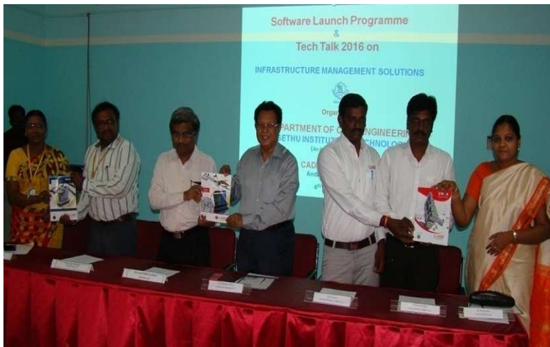
Tech Talk 2016 on INFRASTRUCTURE MANAGEMENT SOLUTIONS On 4th February 2016