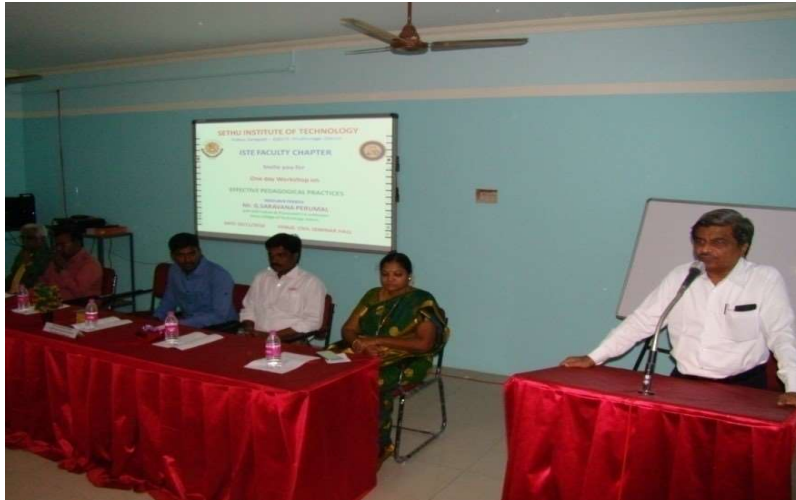
Workshop on Effective Pedagogical Practices on 25.11.2016