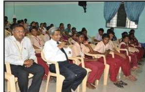
TNSCST Sponsored Environmental Awareness Exhibition for school students