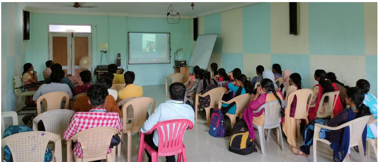
Students and Faculties attending the Online webinar