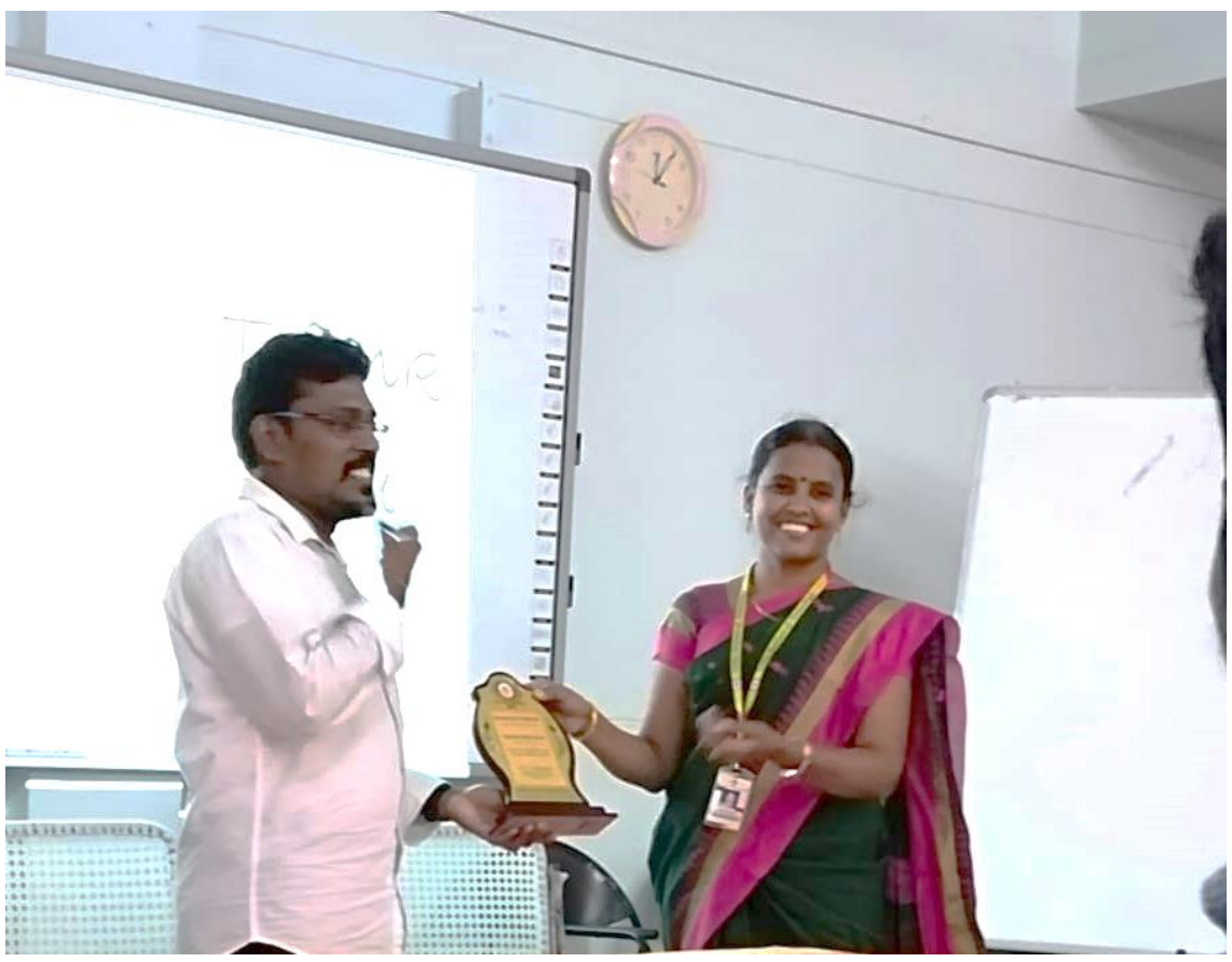
Honouring the Chief guest by Head of the Department