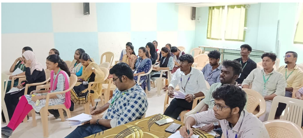
Active participation of students in the events of National Science day