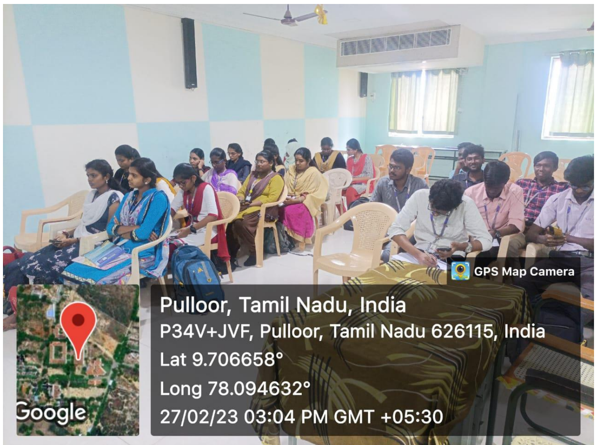
Students attending the webinar