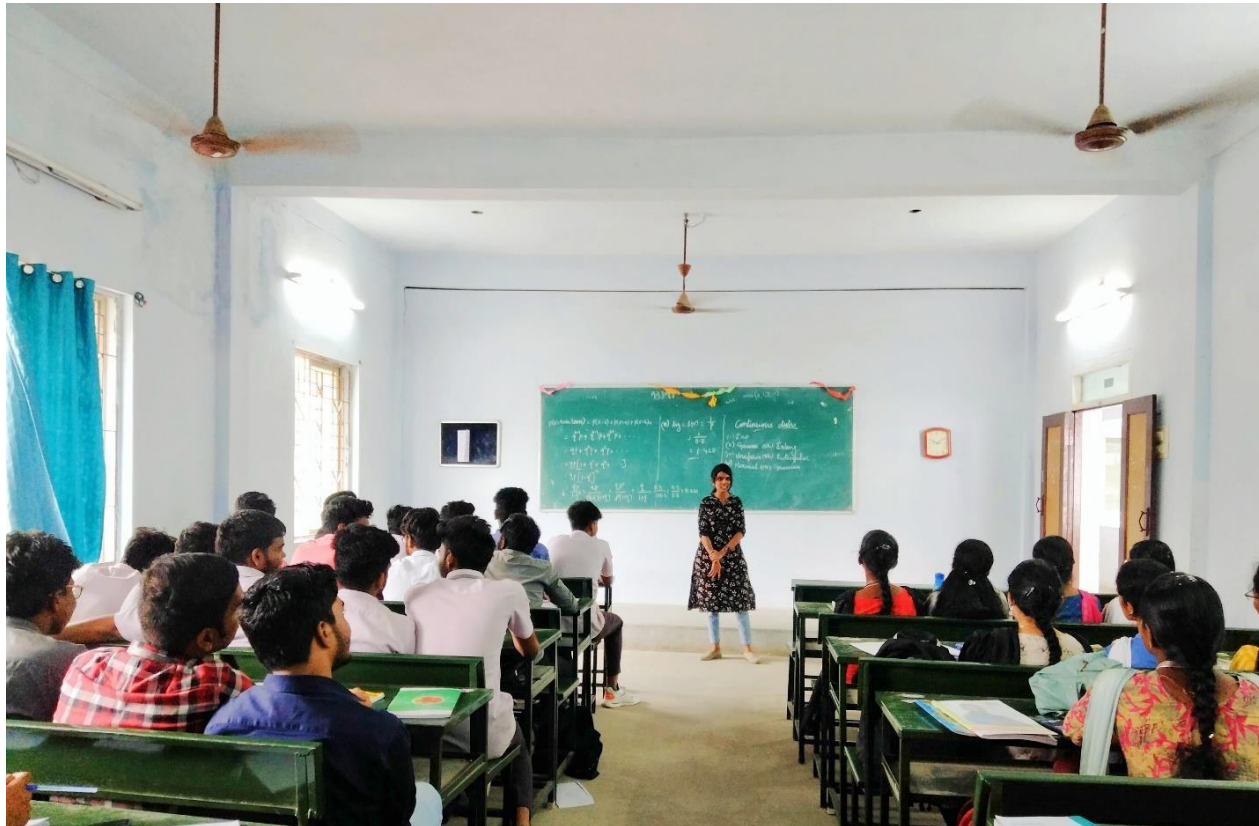
Guest Lecture for BME II Year Students.