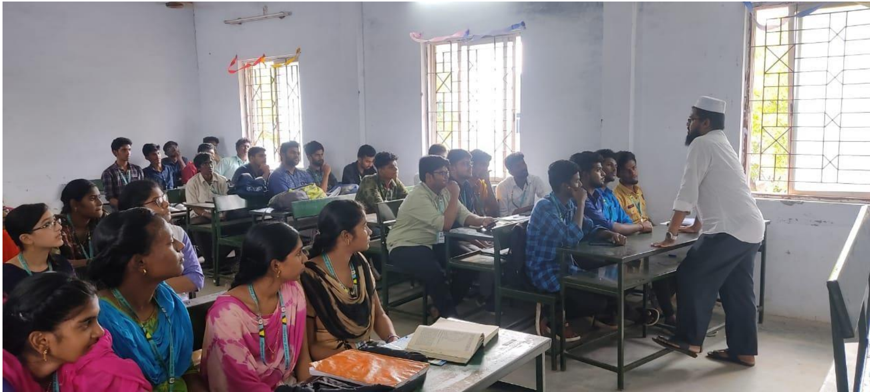
Guest Lecture for BME II Year Students.