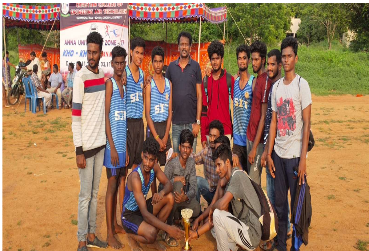
ANNA UNIVERSITY ZONE -17 KHO-KHO TOURNAMENT HELD AT SBM COLLEGE OF ENGINEERING ON 02.11.2019 & 03.11.2019 OUR TEAM EMERGED AS THE RUNNERS”