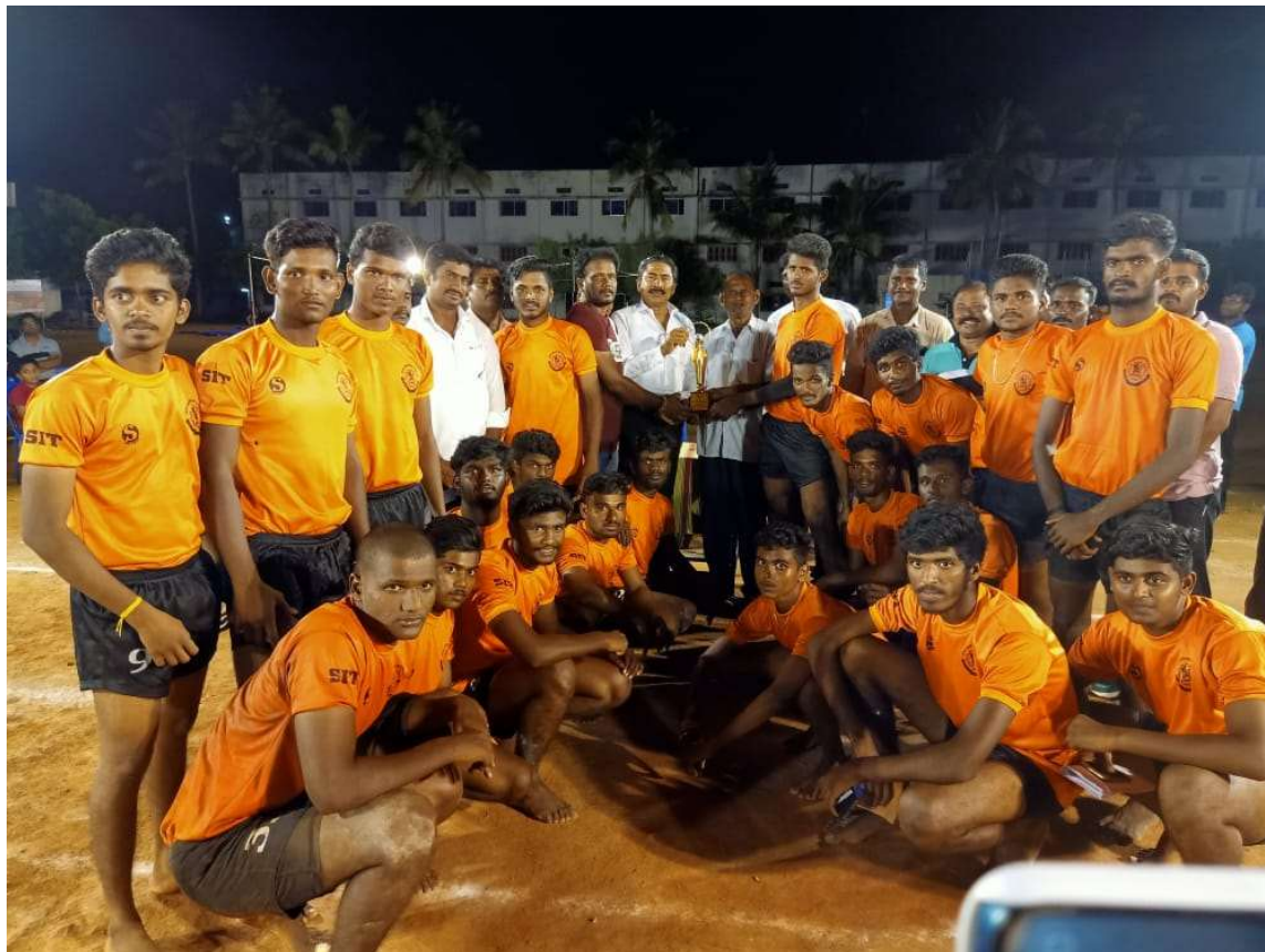
ANNA UNIVERSITY ZONE -17 KABADDI TOURNAMENT HELD AT SBM COLLEGE OF ENGINEERING ON 28.09.2019 & 9.09.2019 OUR TEAM EMERGED AS THE WINNERS”