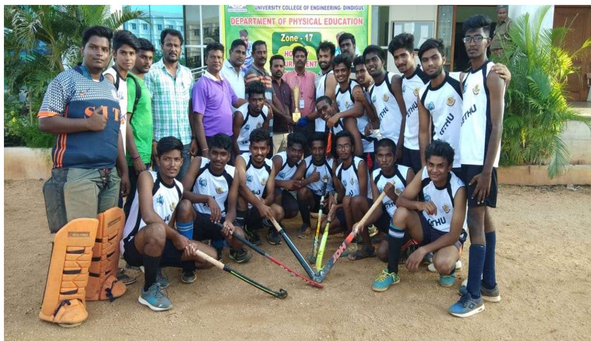
ANNA UNIVERSITY ZONE -17 HOCKEY TOURNAMENT HELD AT SBM COLLEGE OF ENGINEERING ON 30.08.2019 & 31.08.2019 OUR TEAM EMERGED AS THE WINNERS”