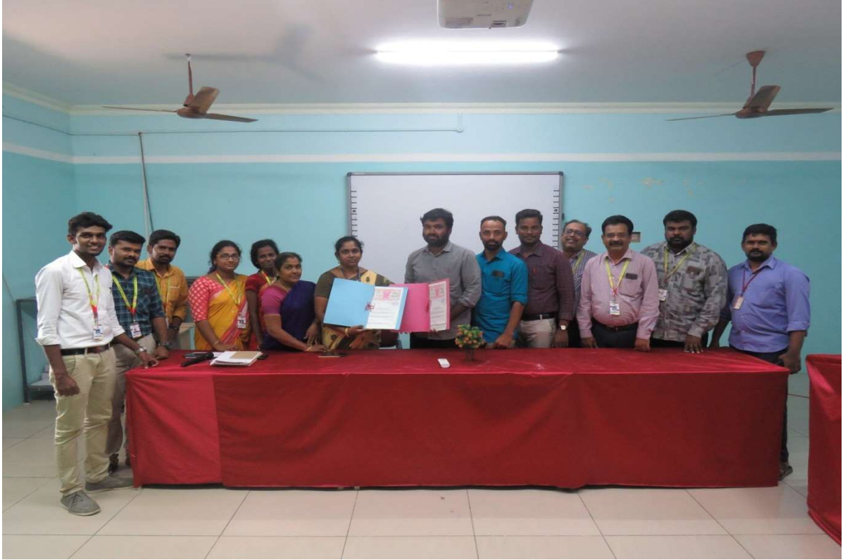
Signed MOU with B.T.R Construction, Erode