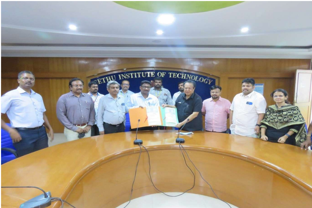
Signed MOU with Edifice Placement Solutions ,Coimbatore