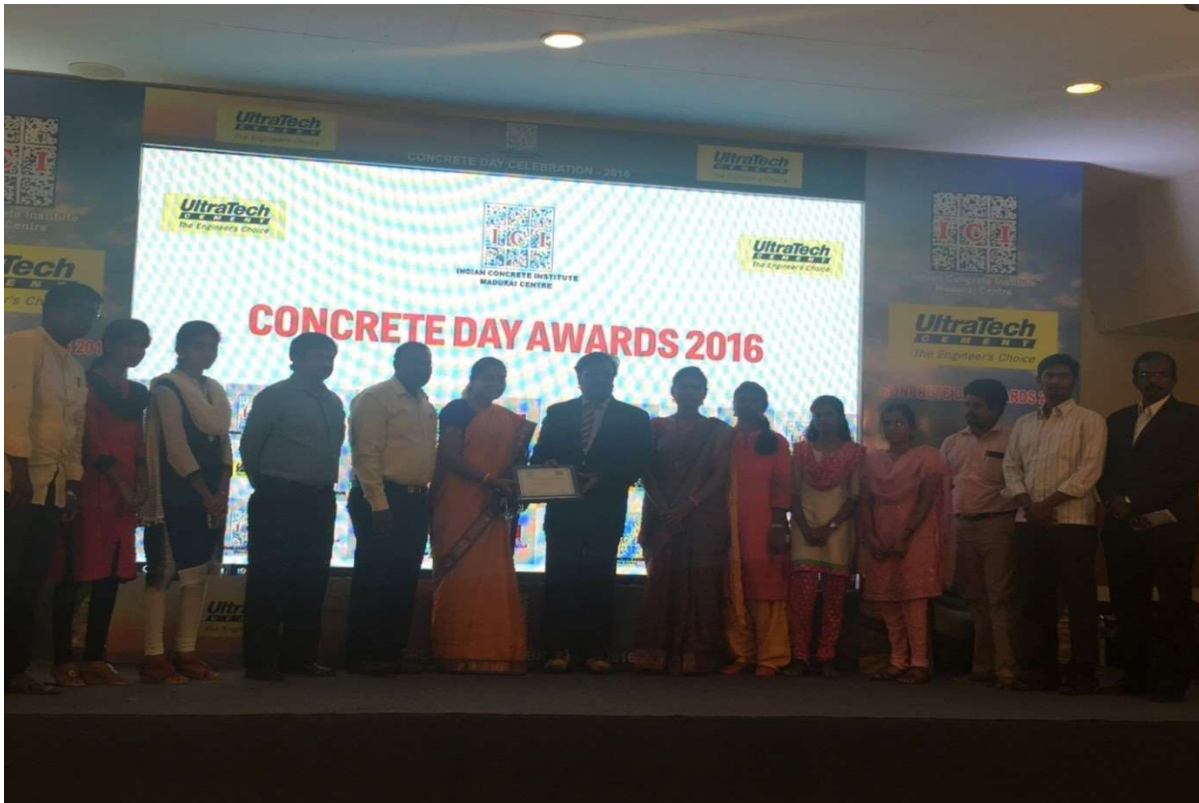
ICI student chapter of our Department was recognized with 'OUTSTANDING STUDENT CHAPTER AWARD' by ICI & Ultratech Cements Ltd on 15-12-2016