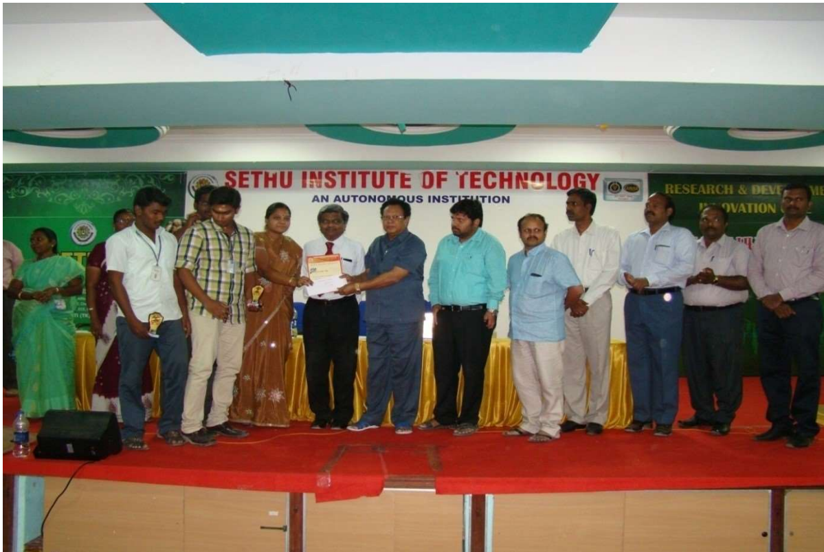
R & D Talent Hunt Competitions on 24.02.2016